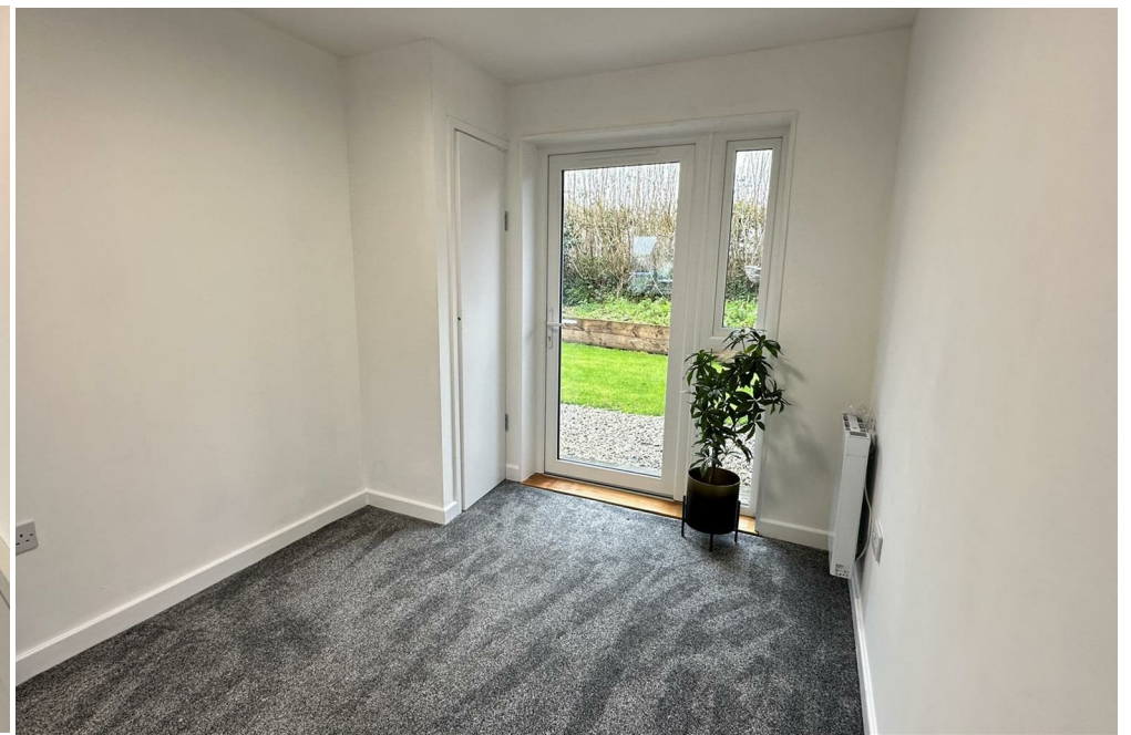
St. Keri Court, Egloskerry, Launceston, PL15 8RS